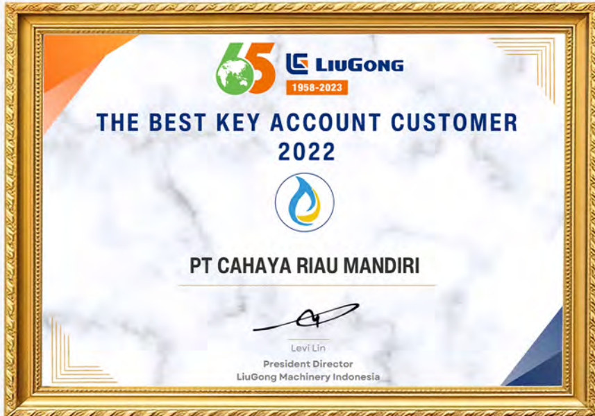
The Best Key Account Customer (Liu Gong) 2022